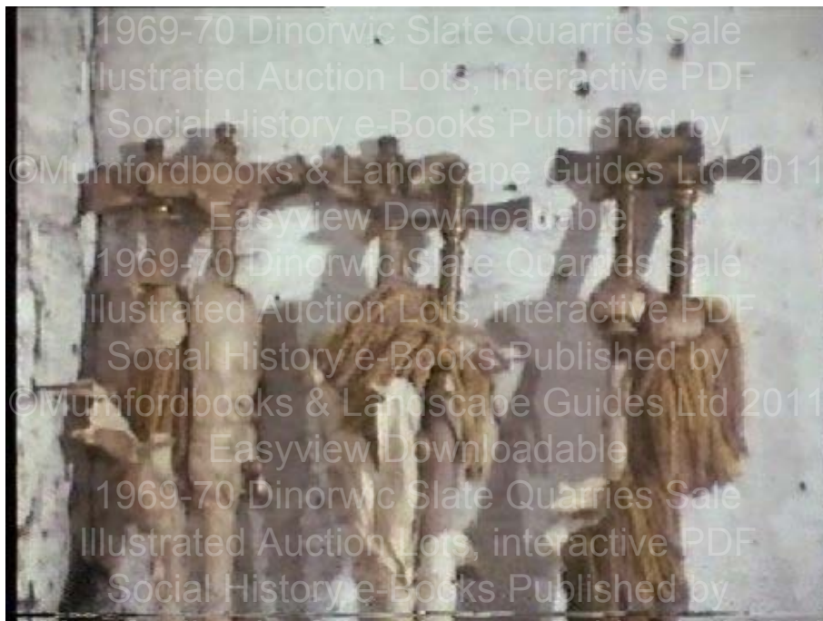
Actual image taken on the Sale Auction day 13 th December 1969

pieces together. Each lot listing a full range of office equipment from the first telephones and typewriters to heavy machinery. Dinorwic, which shut in 1969, contain a wealth of buildings, structures and machines from earlier phases of operation. Dinorwic Quarry's huge quadrangular workshops at Gilfach Ddu were reopened as Amgueddfa Lechi Cymru/Welsh Slate Museum in the 1980s, before which it had been the North Wales Quarrying Museum (in Cadw's care and operated by the National Museum of Wales). The site, which has undergone a massive programme of refurbishment recently, is now part of a Country Park this includes restored features at the Vivian incline of the quarry and a narrow-gauge railway, constructed along the course of the quarry's own railway, closed in 1961 and subsequently dismantled.